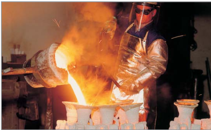
Molten metal being poured in to shell moulds for the aerospace industry.

Key products of the GRS include refractories for addition to the binder, refractory stuccos for the building process of the shell, and high technology shell repair materials.