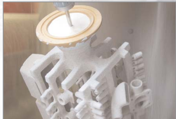
Stucco coating shell mould in rain chamber.